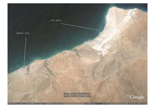
Fig 13. Socotra. Hadibu and Hawlaf Jetty. (Satellite image from google earth).