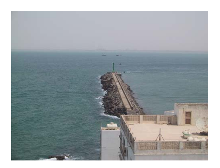
Fig 1. Ras Marbut Breakwater from the Port Control Tower. The CAMA tide gauge pressure sensor is next to the light tower at the end of the Breakwater.

A Microstep MIS integrated weather station / sea level / wave gauge system was installed in 2004 and is presently fully operational at the Port Control Tower, Ras Marbut / Steamer Point at Tawahi (Fig.1, 2 & 3). The Civil Aviation and Meteorology Authority (CAMA) operate this system providing data to the WMO and WMO GTS ( but not tidal height ). (Note: The Microstep MIS system is from Slovakia <a href="http://www.microstep-mis.com">http://www.microstep-mis.com</a>). The CAMA Microstep MIS system is the only operational tide gauge in Aden and Yemen at present to the knowledge of Yemen Ports Authority, GLOSS and CAMA.