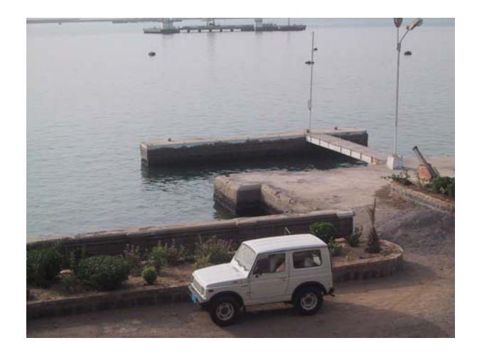
Fig 6. YPA Head Office Jetty (Jetty hand rails removed for repairs).

The depth of water on the outer jetty is only about 1.5 m but it is proposed to dredge this site to allow small pilot boats alongside. The channel nearby has recently been dredged.