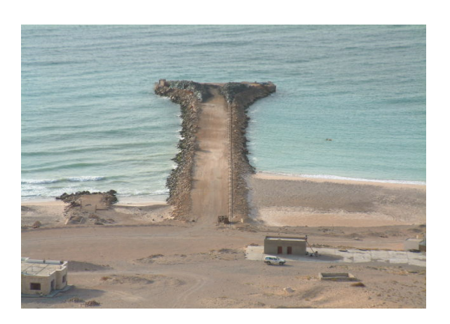
Fig. 15. YPA Jetty at Hawlaf, 7 km NE from Hadibu, Socotra.