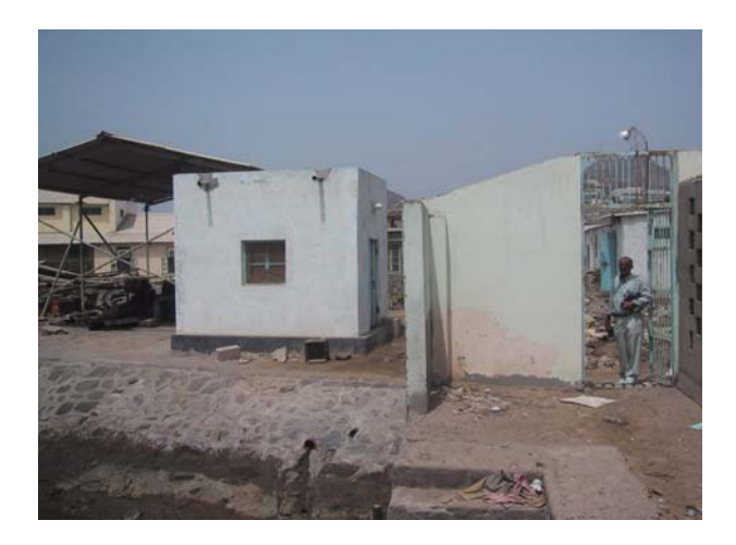
Fig 5. Adjacent watchmen's hut housing the WS Ocean-Systems data logger /printer/chart plotter, with Mahfood M Mohammed Kassim-Chief Hydrographic Surveyor