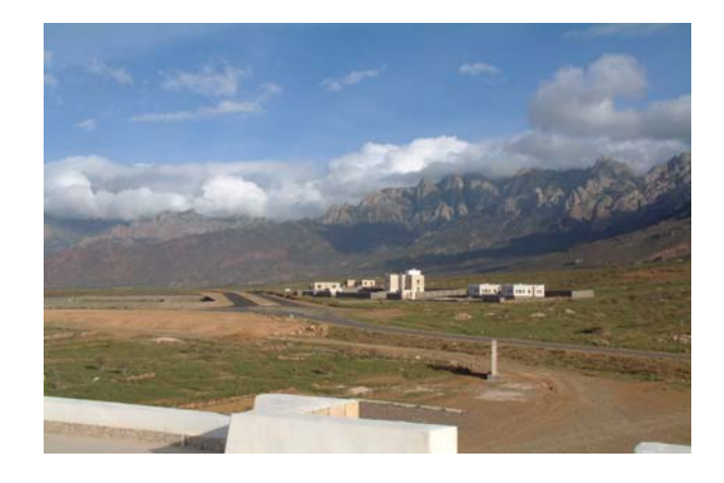
Fig 14. View from UNDP office at Hadibu, Socotra.

Furthermore the logistics of transporting equipment and materials to the island are not easy. Two flights a week from Mukalla are sometimes cancelled due to poor visibility on the island and strong winds in summer (May-September). The small cargo vessels can only berth if sea conditions allow and this would be unlikely May-September. All material would need to be transported to the island with lack of local supplies or resources. Fabrication of the support frame /stilling wells for the tide gauge will need to be done in Aden Port and transported by air /sea to Habibu.