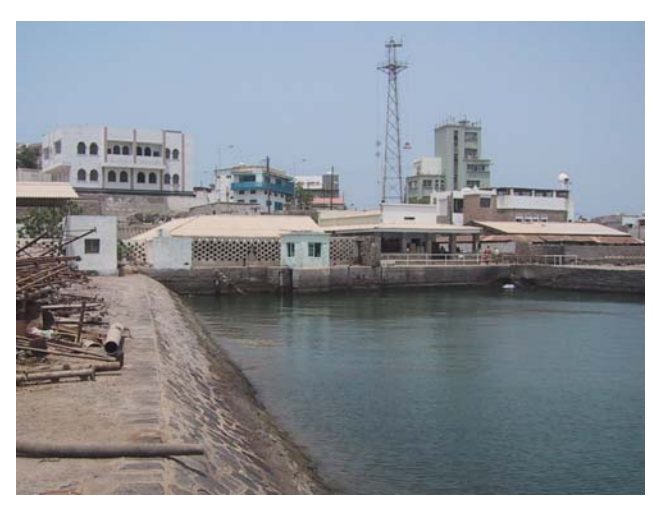
Fig 2. Port Control Tower, Tide Gauge hut (centre) and data logger hut (left of photo) with Pilots Pier on the right at Tawahi.