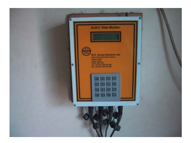
Fig 8. Tide gauge control unit in night watchman's hut.

operational - but they would not be suitable for the IOTWS as data is only printed on paper at hourly intervals. There is also no access to digital data from the system control unit or link to a telephone modem.