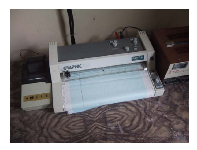
Fig 9. Tide gauge chart plotter and printer in night watchman's hut.