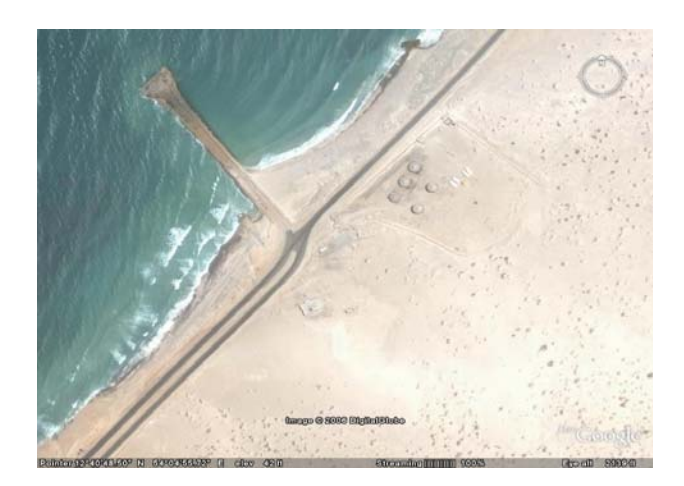
Fig. 12. Hawlaf Jetty, 7km NE from Hadibu Socotra. (Satellite image from google earth)

This is a small YPA Port in the eastern Gulf of Aden with a suitable modern jetty for a GLOSS tide gauge. Co-ordinates 15 49 16 N and 52 11 31E. The town of Nishtun is very small and isolated in the Al Mahra Governate close to the border with Oman.