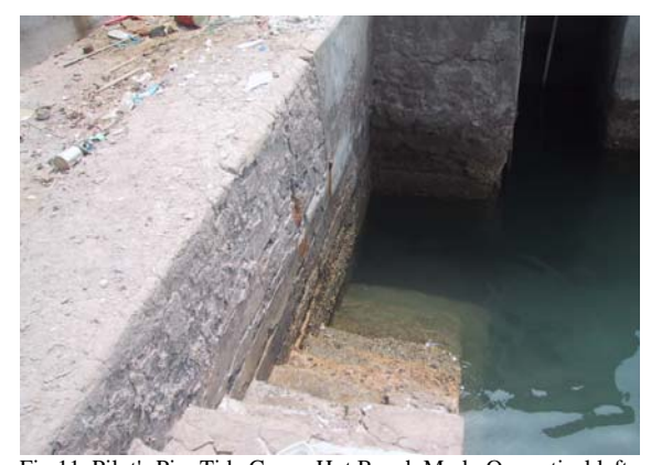
Fig 11. Pilot's Pier Tide Gauge Hut Bench Mark. On vertical left wall above lower step (badly rusting).